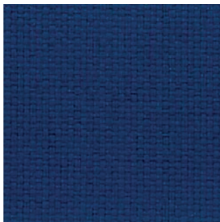
6080 - Blau