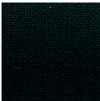
8033 - Schwarz