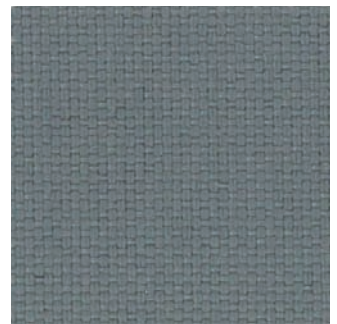
8014 - Mittelgrau