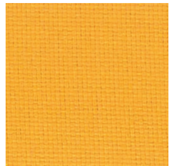
3090 - Gelb