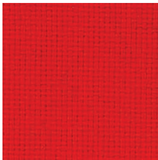
4027 - Rot

Brandschutz: B1 (DIN 4102), EN 1021-1/2, C1 (UNI 9114-UNI 8456), M1 (NF P 92501-7), BS 7176 Medium Hazard